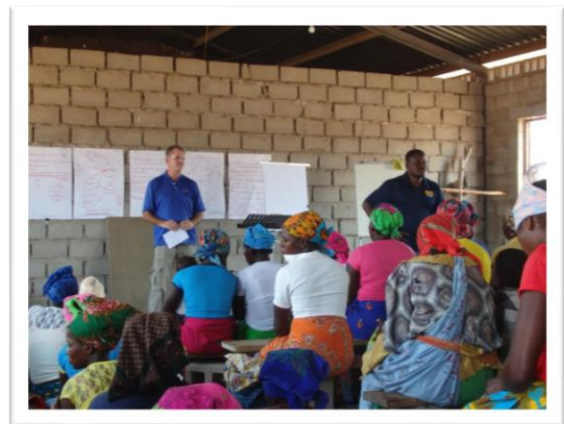
Training in evangelism