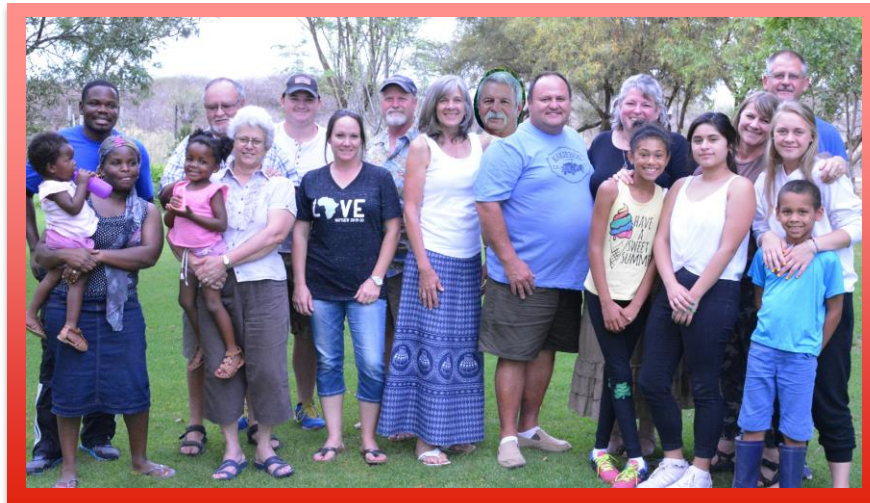
All of us at Samaria Mission with you and your family a very Merry Christmas.