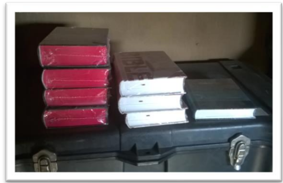
Bibles for Mozambique and Zimbabwe

We are grateful to the Lord for another opportunity to spend time with our brothers and sisters in Christ! Pray that they will take all that they have learned and apply it to their lives and grow in the Lord.