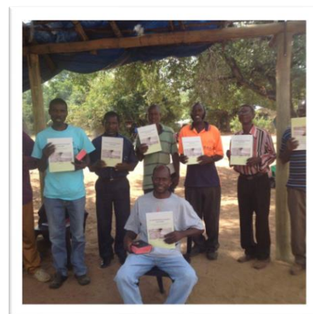
Teaching material in Shangaan