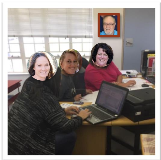
Samaria Mission staff at work