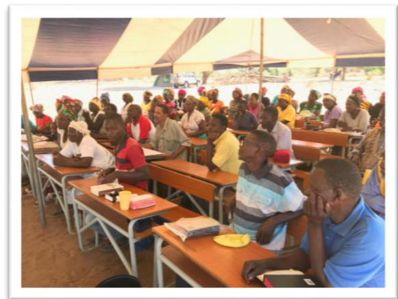
Pastor's Conference in Kunguma