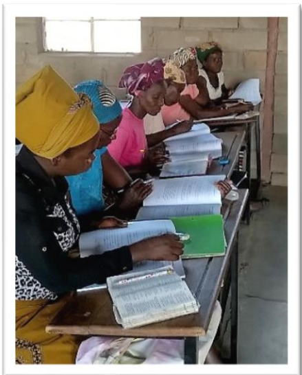
Women at Xikumbani training

Many of you have heard us speaking about CHURCH DEVELOPMENT, but it has come to our attention that this term is unclear and possibly confusing.