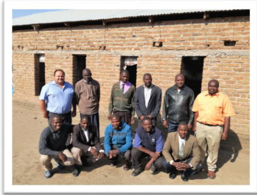
Launch of The Chief Shepherd Bible School