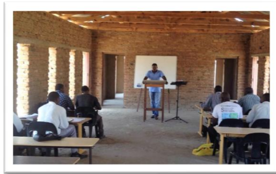
Member teaching at The Chief Shepherd Bible School